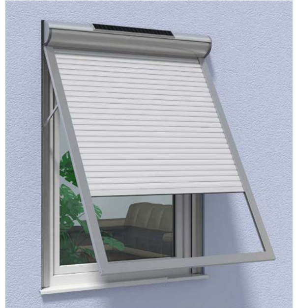
Flared CASSETTO Swing-Shutters

The kink-free guide rail ensures a clean up and down of the respective curtain in every deployment angle.