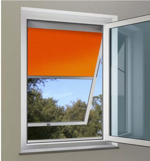
Flared CASSETTO Swing-Zipscreen