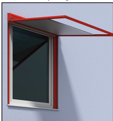
Cassetto Type C Front-mounted roller shutter „with cleaning function“