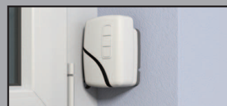
12 v rechargeable battery with optional remote control from OZROLL No power connection required