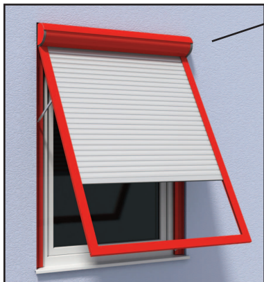
Cassetto Type A Front-mounted roller shutter „with opening function“