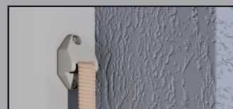
Roller Belt operation