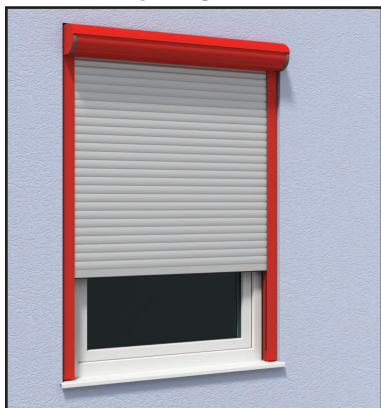
Cassetto Type B Front-mounted roller shutter „without opening function“